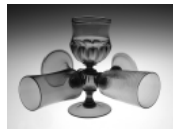
Angus M. Powers

End-of-Session Auction (7:30 pm preview, 8:00 pm auction)